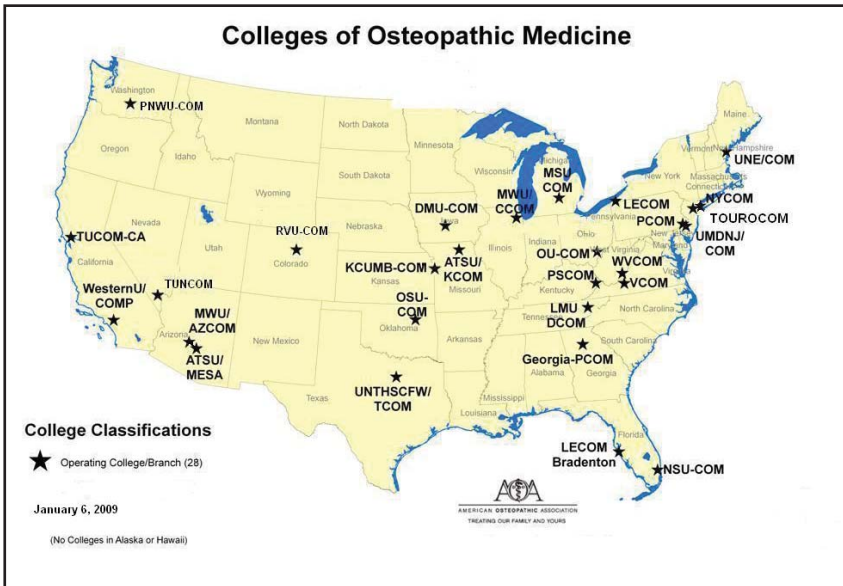
Locations of the 25 colleges of osteopathic medicine (COMs) and 3 branch campuses.